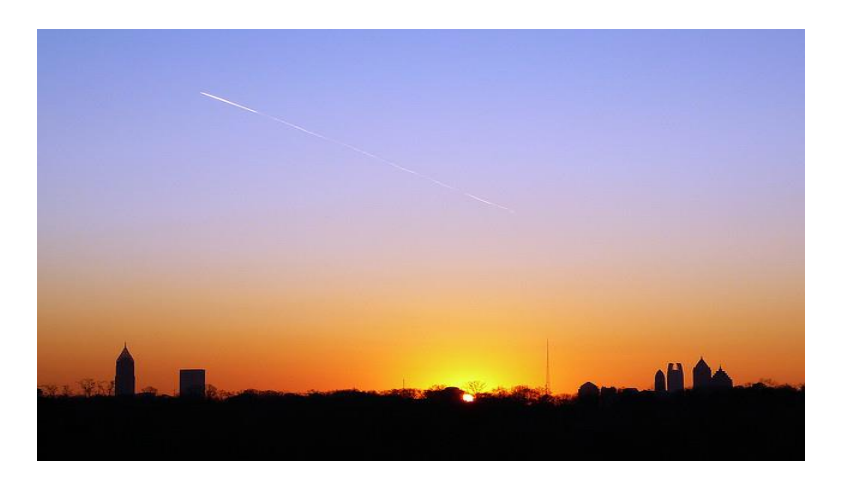
Report on NCFC Board Meetings May 28-30, 2015

It was my privilege to attend recent NCFC Board meetings as provincial chair for New Brunswick. Praise God for His leading of the NCFC Board this past 1 1/2 years as critical decisions were made and future plans were discussed.